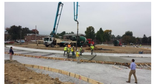
Pouring of Big Roundabout (KY9) October 2016