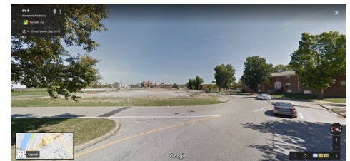
September 2016 – Site Preparing for Big Roundabout (KY9)