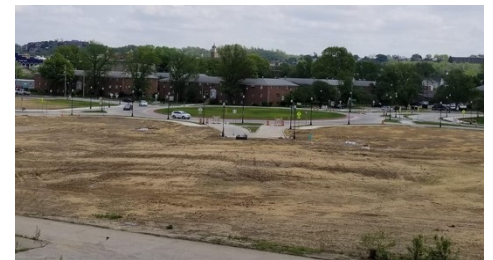
Side view of Final Big Roundabout (KY9) – May 2018