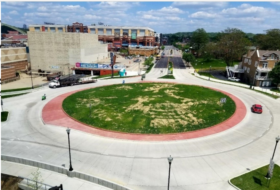
Final Arial of Small Roundabout

Want to learn more about Hilltop capabilities? Contact us today!