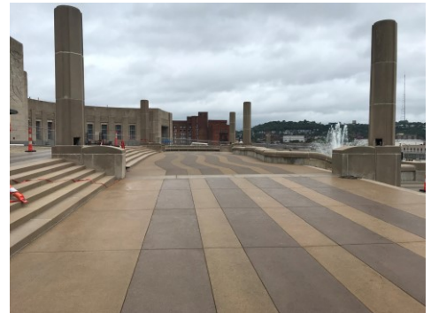
Restored Plaza and Fountain