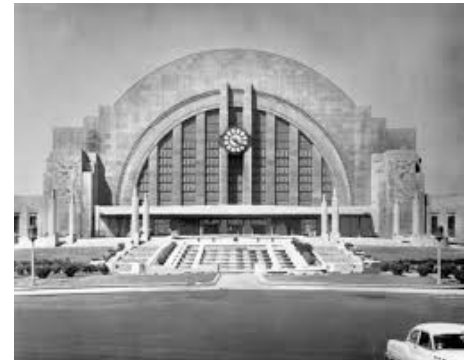
Union Terminal – circa 1933

Union Terminal reopened in November 2018 to great fanfare. The fountain and plaza were a part of the 'grand reveal,' just as when it opened over 80 years ago. The iconic building is now equipped for a long future ahead.