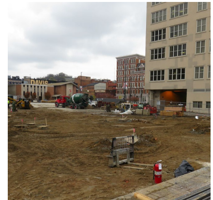
Hilltop Truck Delivering