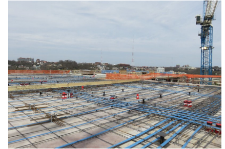
Prepping for Concrete