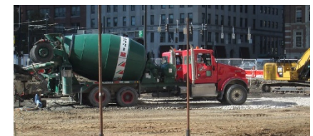
Hilltop Truck Delivering

Want to learn more about Hilltop capabilities? Contact us today!